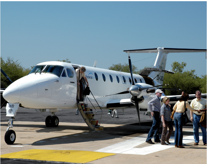
Arrival at bush game lodge